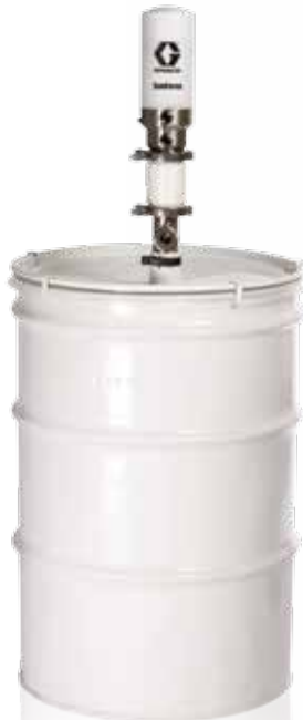
SaniForce 2:1 Piston Pump up to 50,000 cps