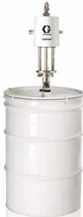
SaniForce 6:1 Piston Pump up to 100,000 cps