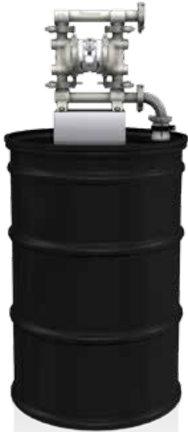
SaniForce 515 FDA Diaphragm Pump with Drum Kit up to 5,000 cps